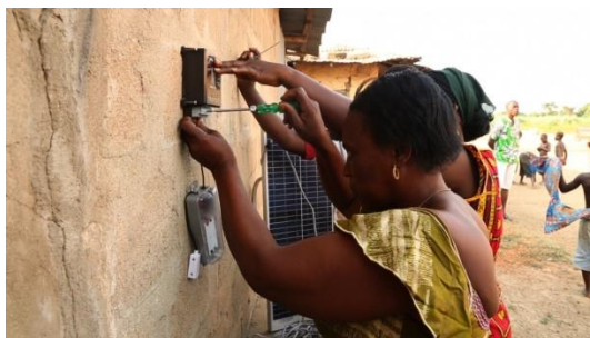
Engineers trained in the project, electrifying a household with solar energy