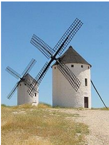
Moulins dans la région de La Mancha, en Espagne