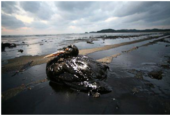
Seabird hibernating in the Bay of Biscay, victim of an oil spill

Moreover, by emitting carbon dioxide (CO 2 ) during their life cycle, fossil fuels contribute to global warming.