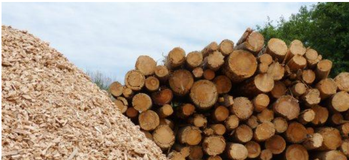
Wood and wood

Biomass is known to generate CO 2 , and is therefore polluting, which is a major disadvantage for biomass energy. In reality, the amount of carbon dioxide it emits corresponds to the amount of CO 2 that is previously absorbed by plants, which are then used as an energy resource. It is therefore an endless cycle that occurs.