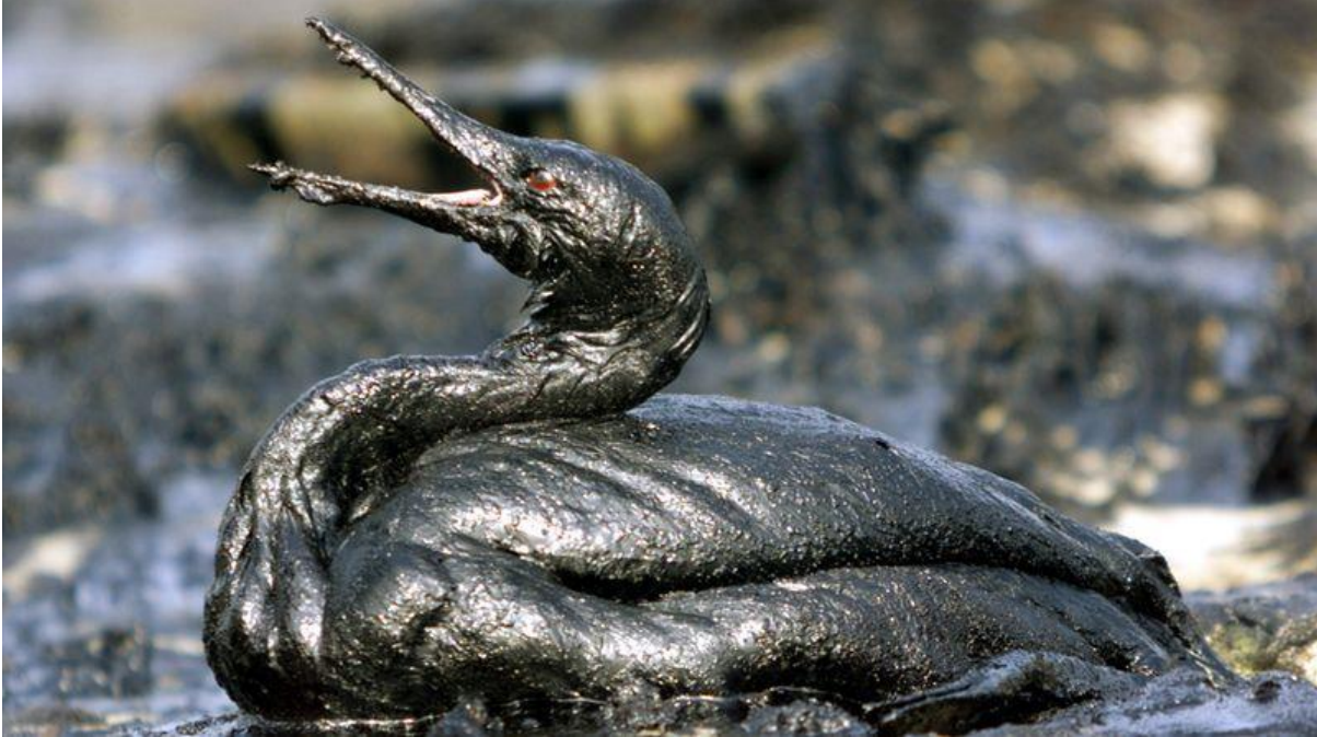
Impact of an oil spill on a bird