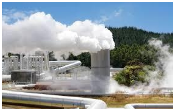
Geothermal energy exploitation infrastructure in Turkey

Drilling can cause land slumps. Geothermal energy can sometimes give off low sulphur vapours if it is used in the form of water or heat. Geothermal energy is not a 100% renewable energy because it requires a generator and therefore electricity. Some heat pumps also use freon: only certain "green" fluids are allowed.