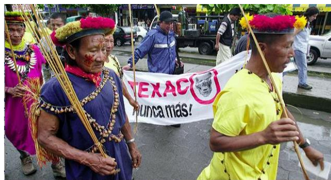
Demonstration against Texaco

After long years of proceedings, demonstrations, power struggles and intimidation of the oil tanker, the Ecuadorian justice system will finally prove them right. In 2011, it orders Chevron to pay a record $9 billion in reparations, damages and interest. This is an unprecedented judgment in the citizen's struggle against a multinational corporation. The feeling of victory however is short-lived, because Texaco has since refused to pay the fine. An unprecedented legal battle ensues between the two parties; two visions of the world, nature and mankind. An abyss separates them. A few days before the judgment in Ecuador, Chevron even filed a complaint against the Ecuadorian side, claiming that « the plaintiffs used Mafia methods to extort money from a very rich company » 41 .