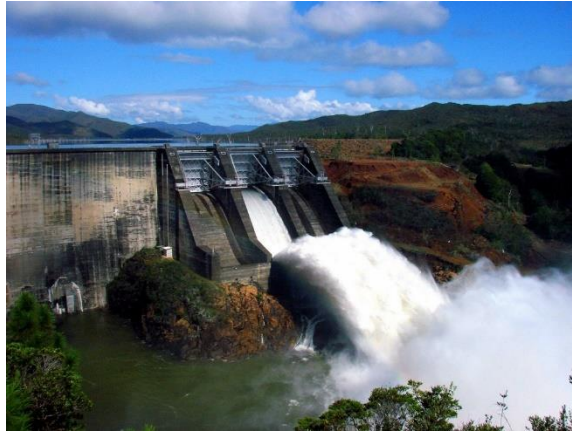
Nangbeto Dam, Togo