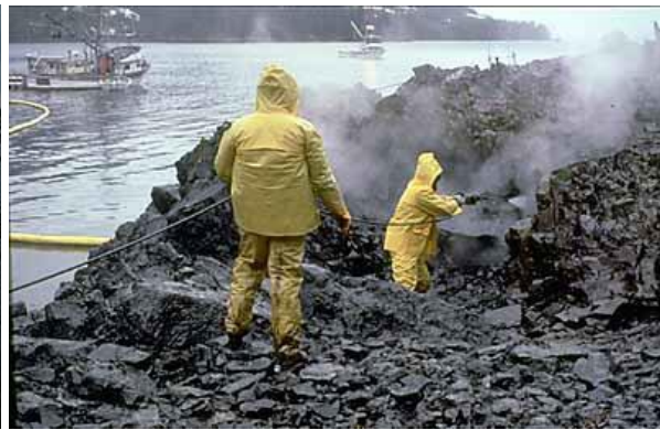
Use of high pressure washing with hot water to clean an oiled shoreline. Prince William Sound Beaches, State of Alaska, USA.

http://tpehmzpetrole20142015.over-blog.com/2014/12/les-impacts-environnementaux-du-petrole.html