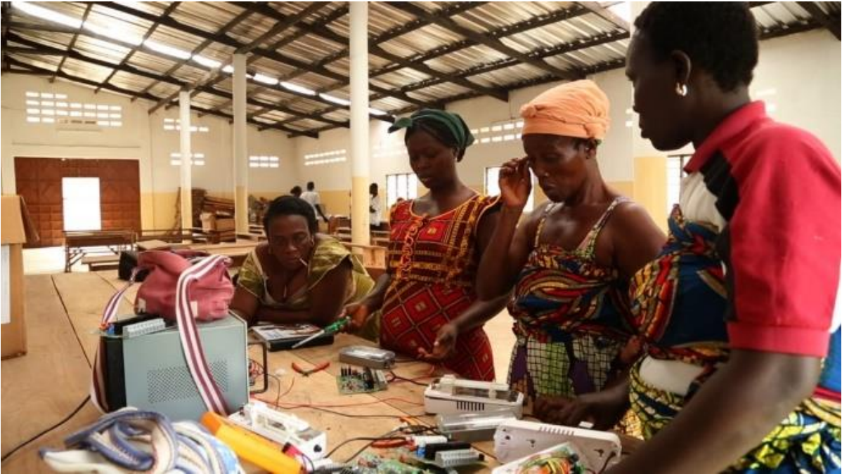
Women who have benefited from training in solar engineering, working in the training and maintenance centre of the NGO "Dekamile», 2015